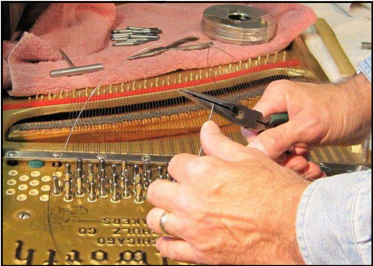
Work in progress on a restringing / repinning job.

"In business to bring your piano to its full potential."