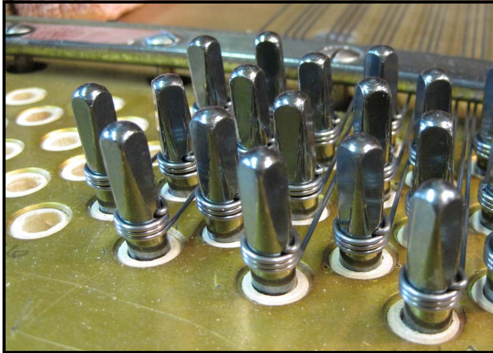
New tuning pins and strings being installed.

For a piano to maintain a stable tuning and sound its best, it is essential that the tuning pins are tight and that the strings are in good condition. When the tuning pins of a piano become loose and tend to slip, the piano will not stay in tune for a reasonable amount of time. When the strings have deteriorated to the point where they are breaking frequently, the tone of the piano will usually suffer as well. Your piano is showing symptoms of problems caused by brittle strings and loose pins which could be lessened or eliminated if your piano were to be repinned and restrung.