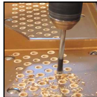
Reaming for tuning pins.

In order to install new tuning pin bushings, the old bushings must first be carefully removed from the cast iron plate. With the old pins, strings and bushings out of the way, the plate may be cleaned up in preparation for the installation of the new parts..