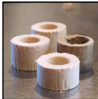
New and old bushings.

The tuning pin bushings of your piano are definitely worn and could stand to be replaced. The ideal time for installing a new set of bushing would of course be when the job of repinning and restringing are done. If the bushings are not replaced and later turn out to provide inadequate support for the tuning pins, it will be too late to make the change.